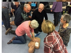
Course attendees learning how to administer CPR.