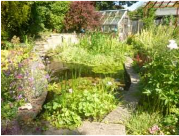
PART OF THE BLOOMING DELIGHTS ON OFFER IN THE GARDEN AT PRINCESS ROAD