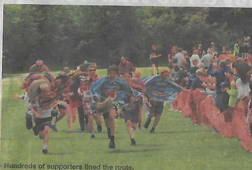
Hundreds of supporters lined the route.