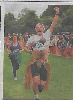
The sun came out for the 34th Knowle Fun Run and (below) Gingy crosses the line.