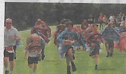
Sprinting to the finishing line.