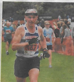
Crowds supported runners along the way.

A further selection of pictures from the annual Knowle Fun Run - pictures courtesy of Dave Edwards @ NewBold Images.