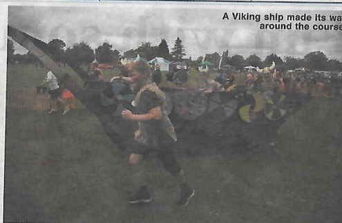
A Viking ship made its way around the course.