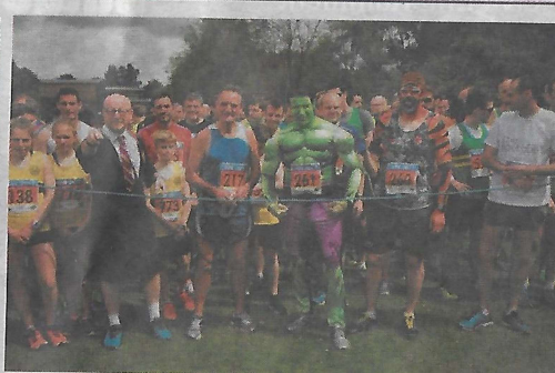
Eagerly awaiting to get underway.