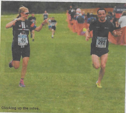
Clocking up the miles.