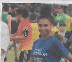
Smiles all round as the sun shone down.

A further selection of pictures from the annual Knowle Fun Run - pictures courtesy of Dave Edwards @ NewBold Images.