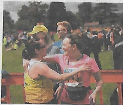
Smiles of joy at the finishing line.