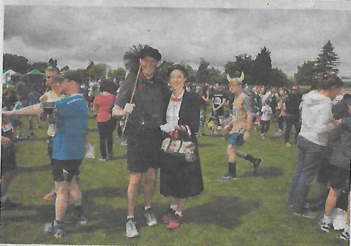
Mary Poppins and Bert dropped by.