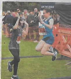
Jumping for joy at the finish line.