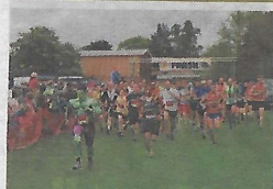
Serious runners and fun runners go side by side in the race.