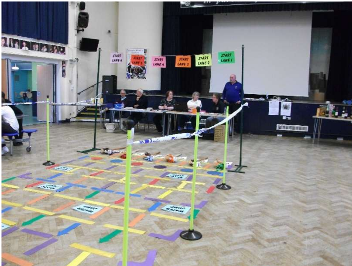
WAITING FOR THE OFF

Recently members of Worcester Lions Club oversaw the races and manned the tote for a 'Race Night with a Difference', that had been organised by some of the members of staff at the Christopher Whitehead Language College, Worcester.