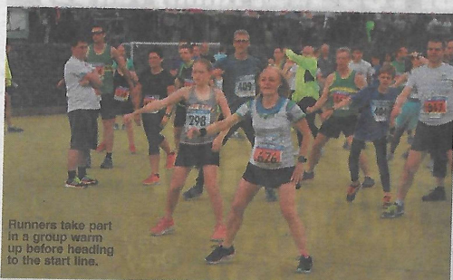
Runners take part in a group warm up before heading to the start line.