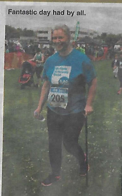
Fantastic day had by all.