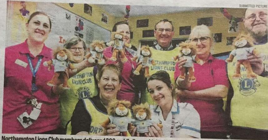
Northampton Lions Club members delivered 300 cuddly lions which will be given to NGH's young patients

Now the club has plans to continue to raise funds to provide more of the toys to help even more boys and girls when they are at their most frightened and unsure.