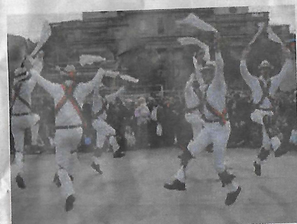
Morris Dancers are set to entertain the crowds. (s)