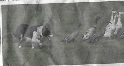
Sheepdogs herding ducks will be one of the features at the carnival. (s)