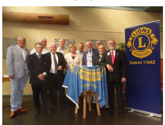
NSL BOARD MEETING DELFT (NL) 10/9/2016

Having visited many clubs over the last year, it is important to start to explain that North Sea Lions (NSL) is not a Lions club in the North Sea, NSL is not