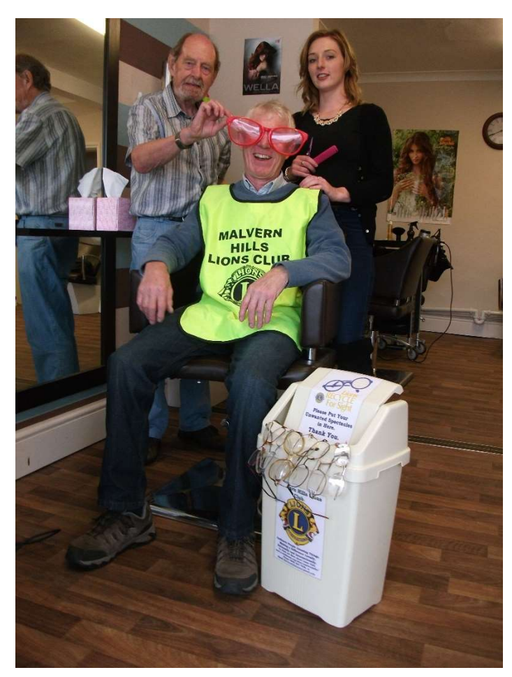
YOU CAN RECYCLE YOUR UNWANTED SPECTACLES WHEN YOU HAVE YOUR HAIR FIXED

At an International Lions Convention in 1925, Helen Keller, who was herself both deaf and blind, challenged the Lions to work towards the alleviation of preventable blindness. The members of Malvern Hills Lions Club are endeavouring to continue to meet that challenge.