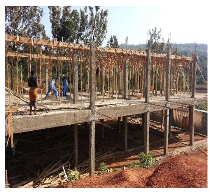
SCHOOL IN KIRCUKIRO RWANDA

- Solar cell electricity 2016-2017 project at a hospital in Tanzania, supported by 106C (DK). A problem with the equipment supplier caused a delay, but now al is on track and everything should get installed in January 2017