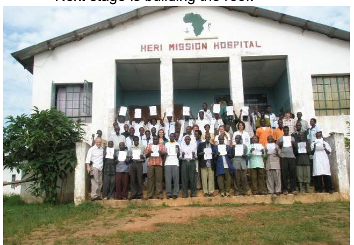
SCHOOL IN TANZANIA, RECIPIENT OF SOLAR ENERGY FIELD