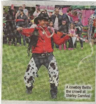
A cowboy thrills the crowd at Shirley Carnival