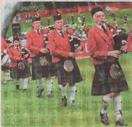
The Shirley Pipe Band entertaining the crowds. 28.016.006.sol.jm1