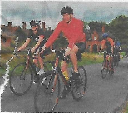
Some of last year's riders leave Packwood House.