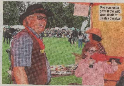
One youngster gets in the Wild West spirit at Shirley Carnival