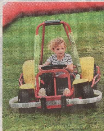
Burning rubber. 28.016.006.sol.jm3