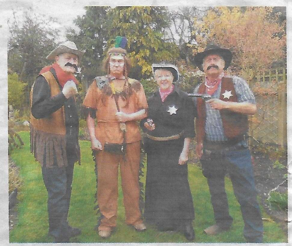
Shirley Lions take a step over to the wild west.

year. "Without the help of local businesses we simply could not run the event