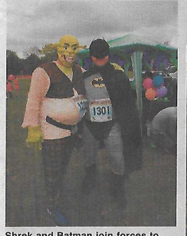
Shrek and Batman join forces to fight evil on the streets of Knowle