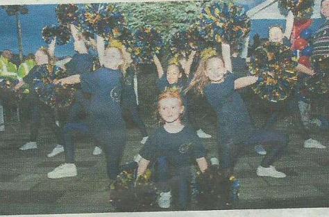
Entertainment by the Sorella Academy of Dance.

THE PEOPLE of Shirley welcomed the start of the festive season at the annual Christmas lights switch-on. Hundreds fathered to enjoy the vari-ety of seasonal entertainment, a visit by Santa and the switching on of the winter illuminations. There was entertainment from Haslucks Green Junior School, danc-ing by Sorella Academy of Dance and stiltwalking courtesy of Aries Entertainment.