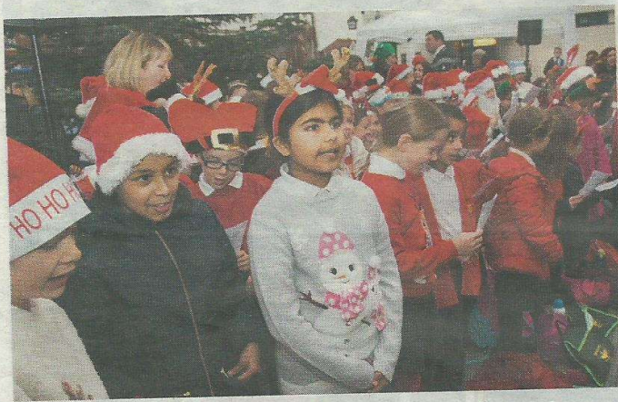
Youngsters from Haslucks Green Junior School gave a fine vocal per-formance.