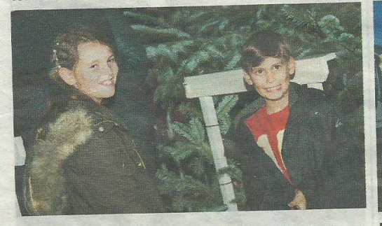
All smiles as the countdown to Christmas begins.