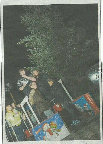
Getting ready for the big switch-on.

THE PEOPLE of Shirley welcomed the start of the festive season at the annual Christmas lights switch-on. Hundreds fathered to enjoy the vari-ety of seasonal entertainment, a visit by Santa and the switching on of the winter illuminations. There was entertainment from Haslucks Green Junior School, danc-ing by Sorella Academy of Dance and stiltwalking courtesy of Aries Entertainment.