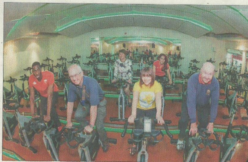
A group of athletes training in preparation for the 12th Blythe Valley Park Charity Duathlon.