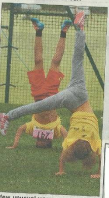
A few unusual warm-up exercises.