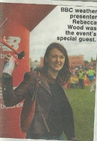
BBC weather presenter Rebecca Wood was the event's special guest.