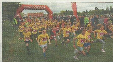
Old and young alike turned out for the Fun Run.

The event is set to have raised around £40,000 for local causes.