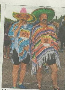
Adding a splash of colour.