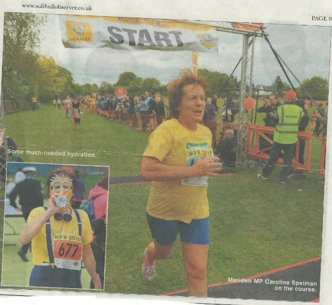
Some much-needed hydration.