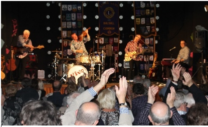
Vivo in concert