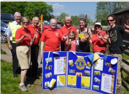
the Hinckley and Burbage Lions Club.

Entries are open for this year's 32 nd Knowle Fun Run on Sunday 17th May . Hundreds of runners have already made their New Year's resolution to run in Solihull's biggest fundraising event of its kind. Why not join them for this popular 5 mile Fun Run with great community atmosphere on traffic-free streets and help raise funds for Arthritis Research UK, Knowle Football Club, Solihull Young Carers and local causes. More details and enter online now at www.knowlefunrun.org.uk .