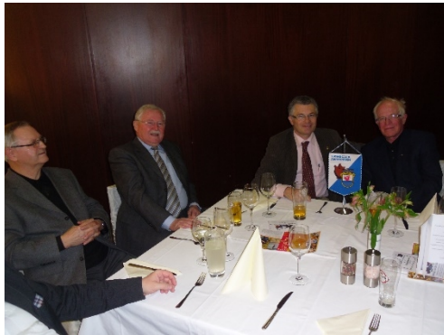
Having dinner with Amstetten Lions

The club website stated they have 50+ members and seeing reports of their good causes made it clear that they serve their community with vigour, just like good Lions do.