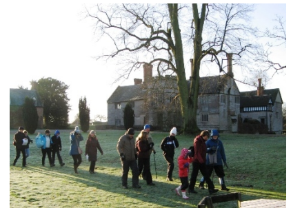
Early walkers head off past Baddesley Clinton House

Anyone who missed the walks for whatever reason may download the map of the routes from www.knowleanddorridgelions.com/walk and tackle them at their convenience