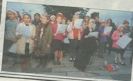
Left - Children from Haslucks Green Junior School get the festivities under way with some carol singing. 48.014.002.sol.jm1

THE COUNTDOWN to Christmas began in Shirley as townsfolk turned out for the annual lights switch-on.