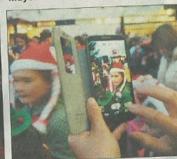
A festive photo for this proud mum... 48.014.002.sol.jm2