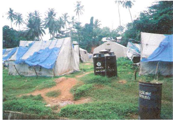
Unhygienic living conditions as at 25 March 2006

By May 2006 many victims were still living in unhygienic conditions in temporary shelters that had no clean running water, electricity, sewage or drainage system. This made Bushby Lions even more determined to try and bring quality of life to as many people as possible with the fund raising capability of its 19 members.