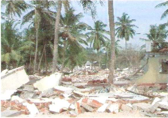
The Damage – December 2004

Following the Tsunami disaster on Boxing Day 2004, Bushby Lions committed themselves to help to re-house some of the victims in Sri Lanka. Although land was allocated for this purpose in February 2005, it took Bushby Lions almost 15 months to get possession of the plot from the Sri Lankan Government and a further three months to get permission to clear it and start work on it.