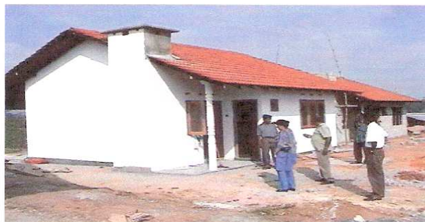
The completed house looks like this

Each house comprises of two bedrooms, living/dining area, a kitchen, toilet, shower and two verandah areas. Electricity and water supply connections are included. The total cost is £3,500 per house. Not a penny of donations is used for administration costs. Members pay these costs out of their annual subscription.