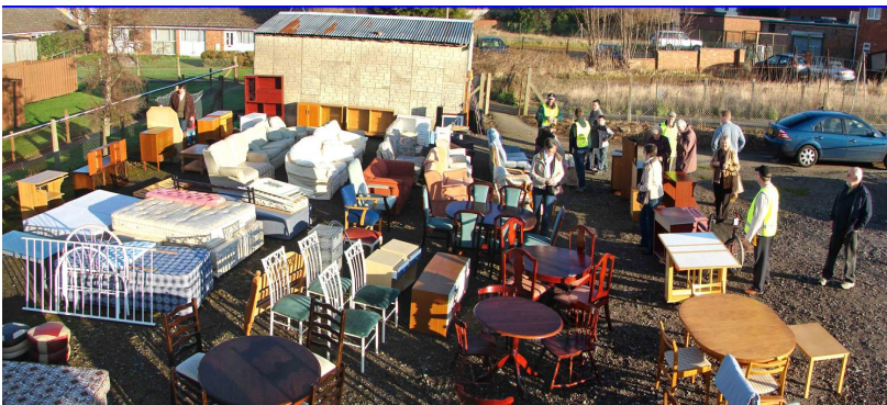
The Monthly Furniture Sale

We've been keeping a pretty low profile for the past 25 years or so because we have so much fun doing the things we do. Unfortunately we have been found out by the DG and he has insisted that we tell you about 'life with the Lions' here in Southam!